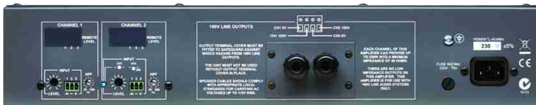
Cloud CXV-225 rear view